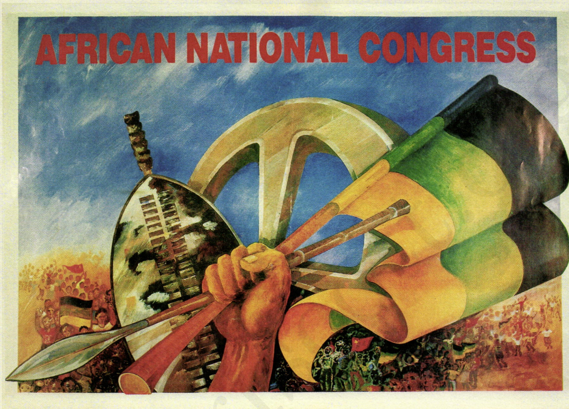
Visual Source 23.2 African National Congress

In Vietnam, the struggle for independence was a prolonged process and took place against a variety of enemies. French colonial rule had prompted various kinds of resistance since the late nineteenth century. Then Japanese occupation of the country during World War II stimulated the formation of a nationalist party known as the Viet Minh, dominated by a communist party and led by Ho Chi Minh. After Japan's defeat in World War II, that movement continued as an effort to oust the French, which succeeded by 1954. At that point, Vietnam was divided between the communist-dominated North Vietnam and the U.S.-backed South Vietnam. What followed was a twenty-year effort by North Vietnam and communist supporters in the south to reunify their country and to drive out the American military forces, which numbered over a half million by the mid-1960s.