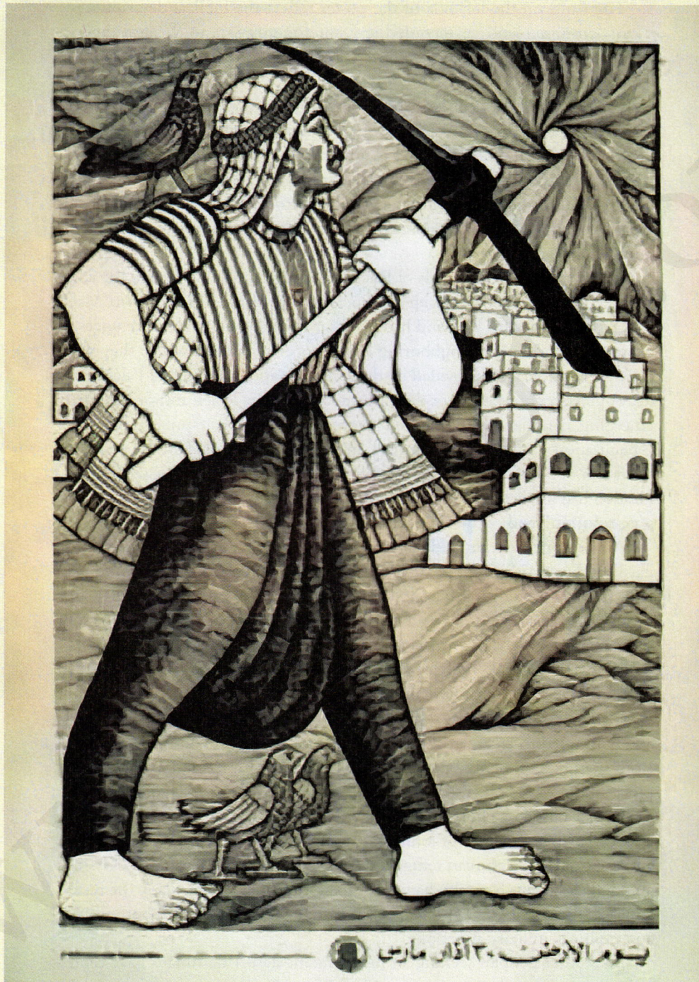
Visual Source 23.5 A Palestinian Nation in the Making