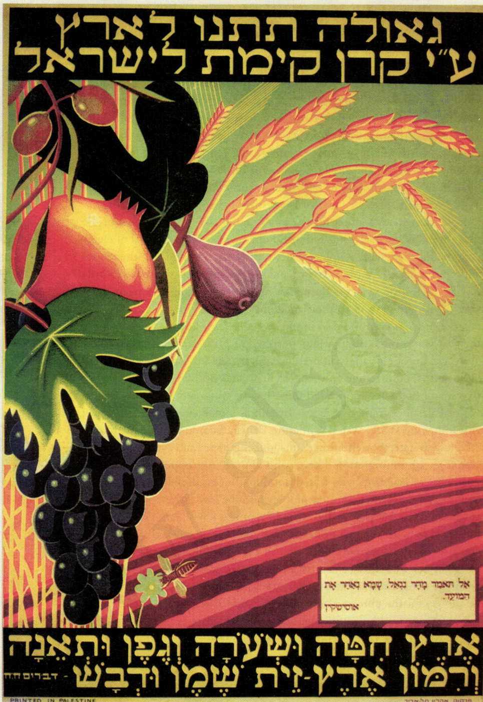
Visual Source 23.4 Winning a Jewish National State