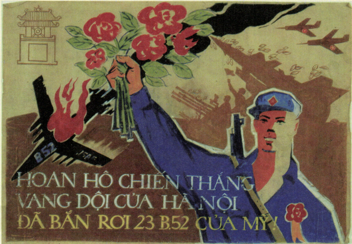
Visual Source 23.3 Vietnamese Independence and Victory over the United States

surprising turn of events have been debated ever since, it was clearly of enormous significance for Vietnamese understandings of their national independence. Visual Source 23.3 presents a Vietnamese poster, dating from somewhere between 1965 and 1975, that celebrates one aspect of that unlikely achievement. The caption reads: “Bravo for Hanoi’s Tremendous Victory When 23 B-52s Were Shot Down!”