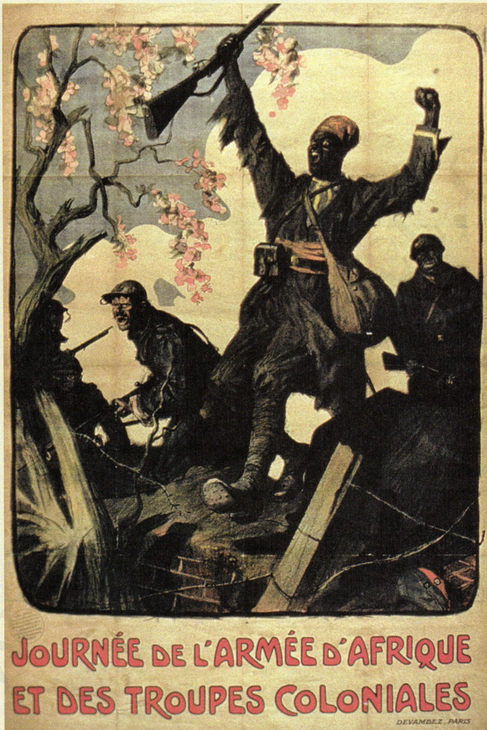
Visual Source 21.3 War and the Colonies