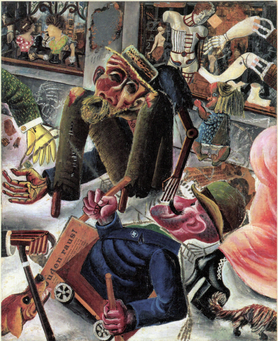
Visual Source 21.5 The Aftermath of War (© 2012 Artists Rights Society (ARS), New York/VG Bild-Kunst, Bonn)