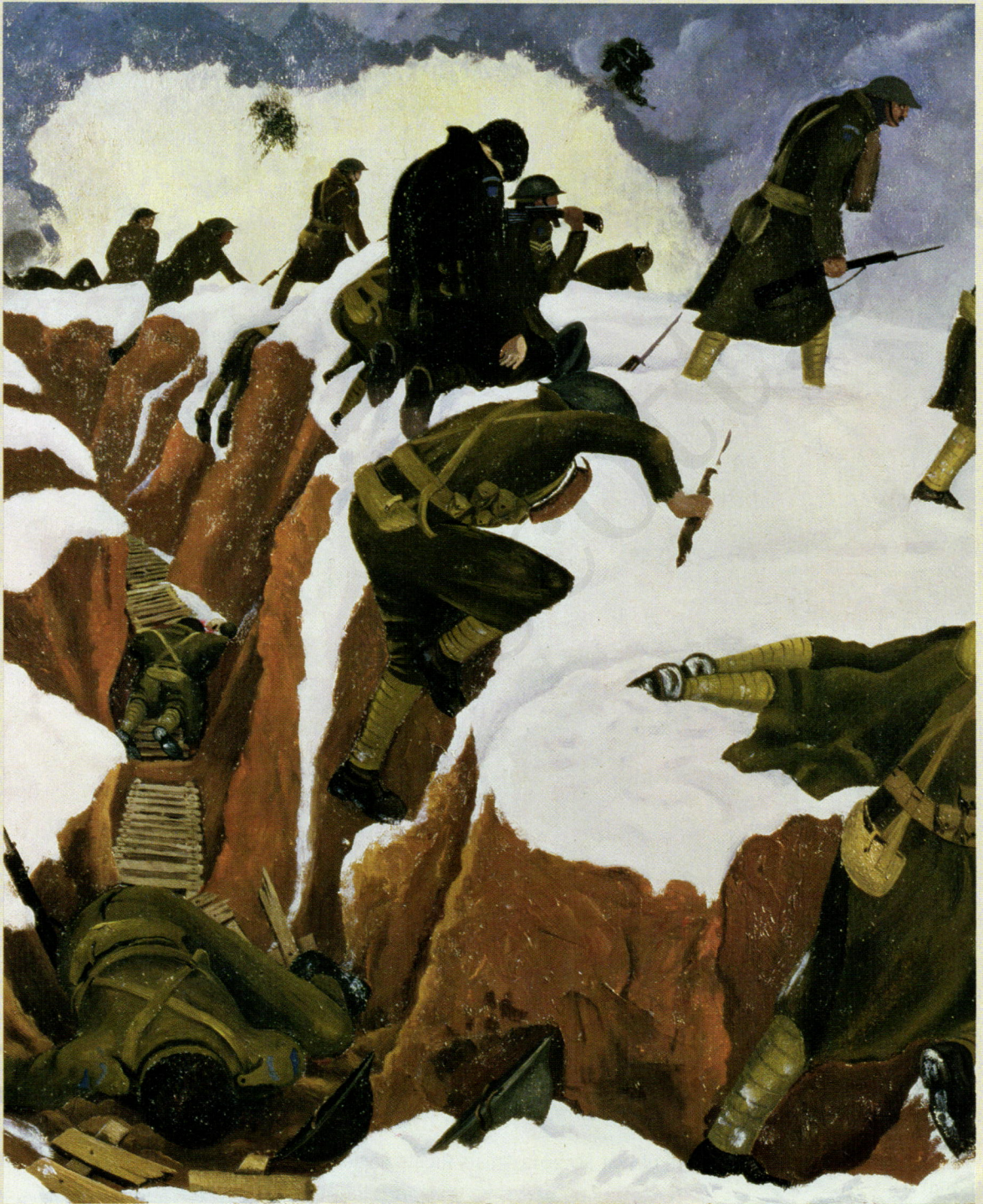
Visual Source 21.4 The Battlefield