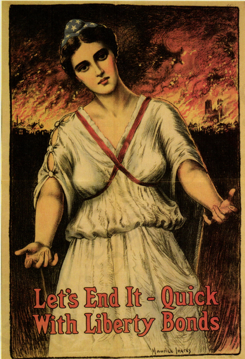
Visual Source 21.1 Women and the War

Among the chief uses of wartime propaganda posters was to portray the enemy in the most despicable terms. German posters, for example, often depicted the country's enemies as animals or misbehaving children, suggesting that they were something less than fully human. They usually showed Russians as alcoholics. Visual Source 21.2 is a French poster from around 1915.