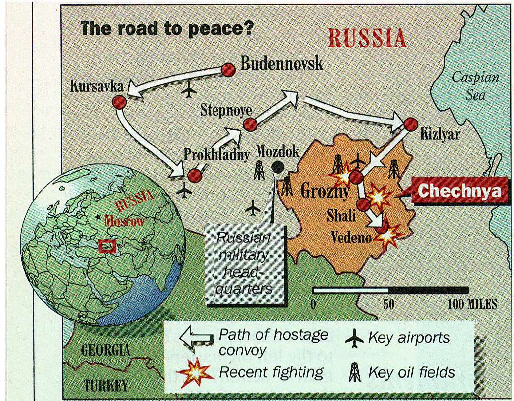
Figure 2- Figure 2 Map of Chechnya

By May 1995, the Russians controlled the main Chechen cities and towns and pushed the fight into the mountain villages of Chechnya. The fatalistic feeling among the Chechen forces was summed up in the comments of the deputy commander of the Chechen battle group deployed outside of Grozny, "There is no winning. We know that. If we are fighting, we are winning. If we are not, we have lost. The Russians can kill us and destroy this land. Then they will win. But we will make it very painful for them." 25 Combat during this period resembled a large scale chess match, with