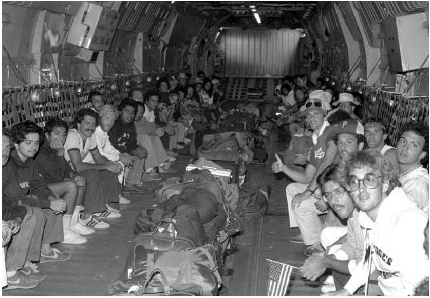
Evacuation of students from St. George's University School of Medicine on Grenada during URGENT FURY