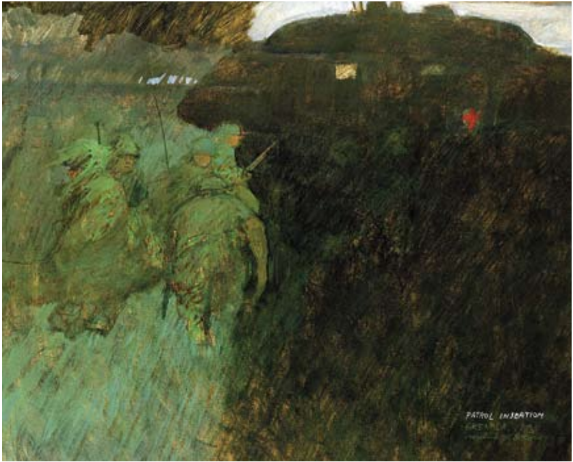
Patrol Insertion, Grenada, November 1983, by Marbury Brown

While securing the warehouses, men from Company C watched as five gun jeeps of the battalion's reconnaissance platoon were ambushed by Cubans. The Cubans let the first two jeeps go past and opened fire on the last three. The lead jeeps wheeled back toward the ambush zone with machine guns blazing. Company C opened fire as well and began placing mortar rounds on the Cuban positions. The Cubans broke contact and fled, leaving behind four dead. There were no U.S. casualties. The troops continued the advance east until sunset, when they halted and established a defensive perimeter.