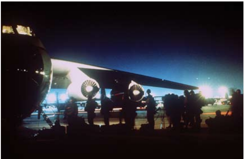
Paratroopers of the 82d Airborne Division board a C-141 aircraft for deployment during URGENT FURY.

The 82d Airborne Division's buildup of forces on the airfield continued throughout the afternoon and evening of 25–26 October. The last of the 2d Battalion, 325th Infantry, reached the airstrip before dusk,