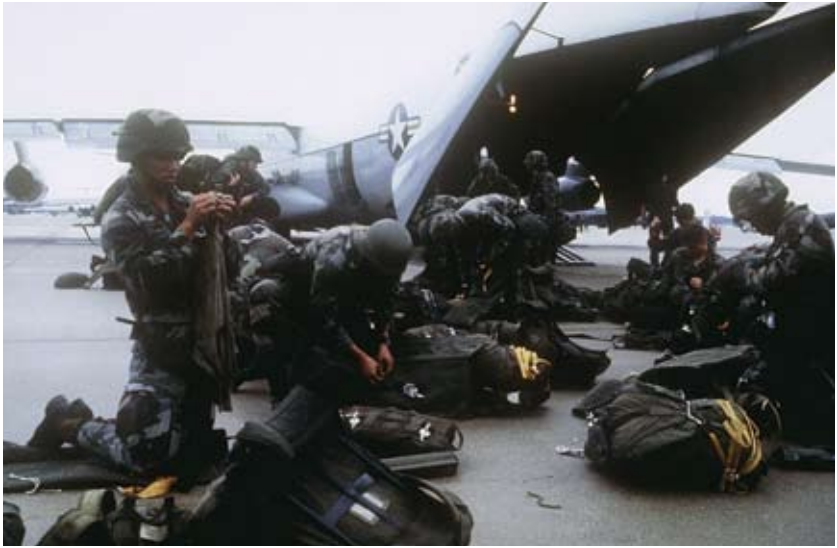
Troops of the 82d Airborne Division gather their gear and prepare to board a C-141B Starlifter bound for Grenada.

parachute assault while the planes were in flight. He wanted to be ready for a combat drop regardless of the outcome of the Ranger assault or the condition of the airstrip at Point Salines. Rigging the equipment for an airdrop was impossible, but the men could “hit the silk” if necessary. Finally departing Pope Air Force Base by midmorning on the twenty-fifth, the men of the 82d Airborne Division continued to work during the flight to prepare for whatever awaited them on an island of which few had ever heard.