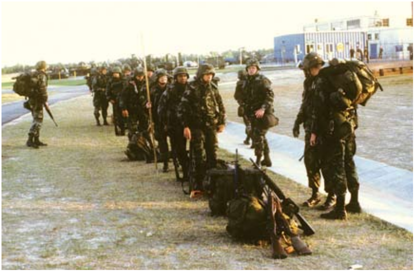
Combat-equipped paratroopers of the 82d Airborne Division awaiting deployment during Operation URGENT FURY