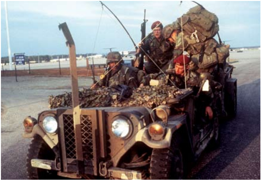
Members of the 82d Airborne Division wait in an equipment-filled light utility vehicle before boarding aircraft for deployment to Grenada. The vehicle has a wire-cutting bar mounted on the front.

the critical functions of logistics, communications, and especially the complicated ballet of the airflow (the arrival, loading, and movement of Air Force transporters in conjunction with Army airborne soldiers) that the XVIII Airborne Corps performed for the 82d. Many of the support resources the division needed in an airborne operation—communications with the Air Force, engineers, loading ramp operations, medical support, airdrop and rigging support, and even water purification units—were provided by the corps. The corps was also a critical element in planning and conducting air assaults. Cutting it out of the chain of command threw a heavy and unexpected burden on the already overworked 82d Airborne Division staff.