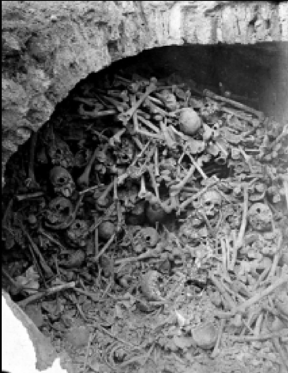
Human Bones in a Plague Pit