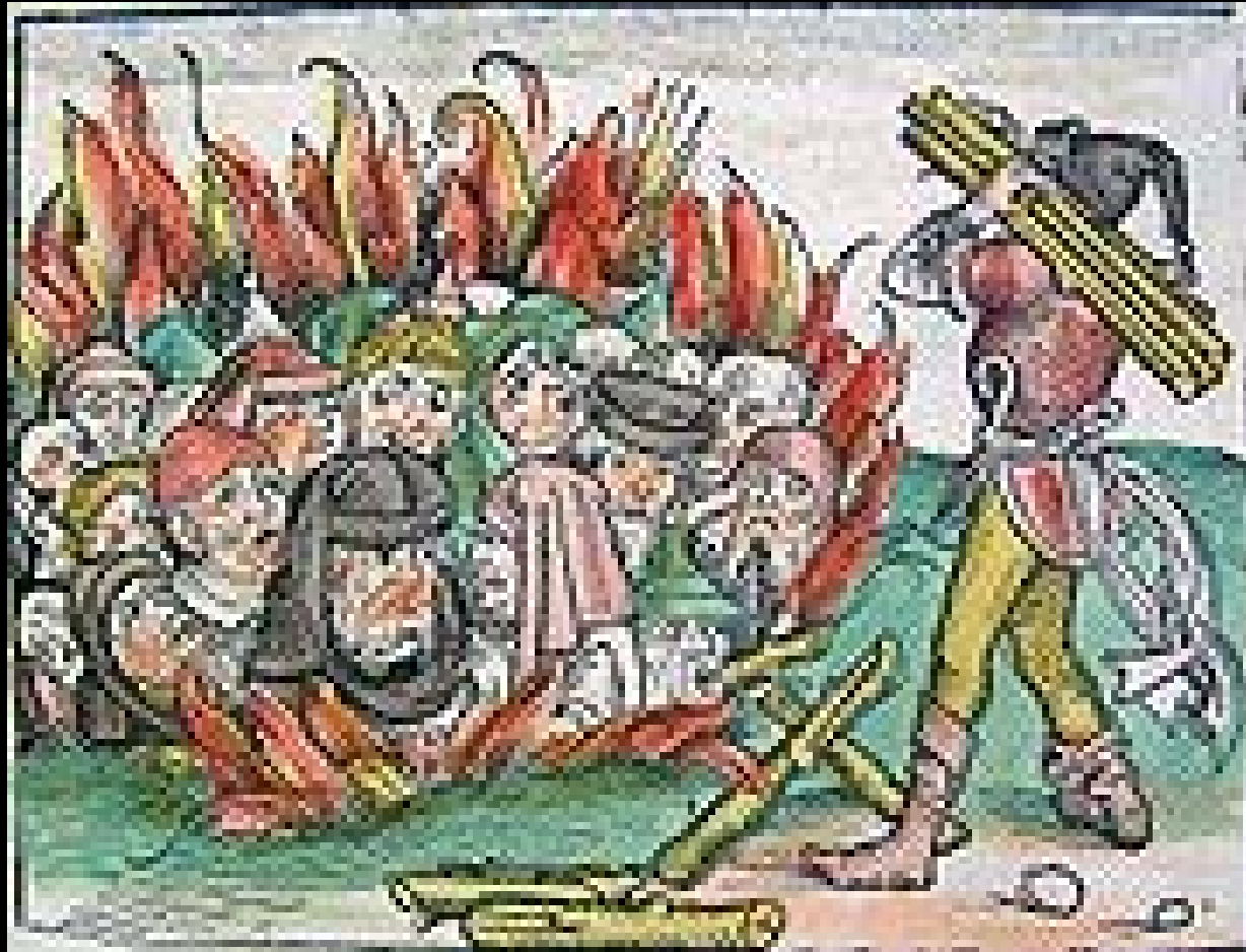
Burning Jews Alive