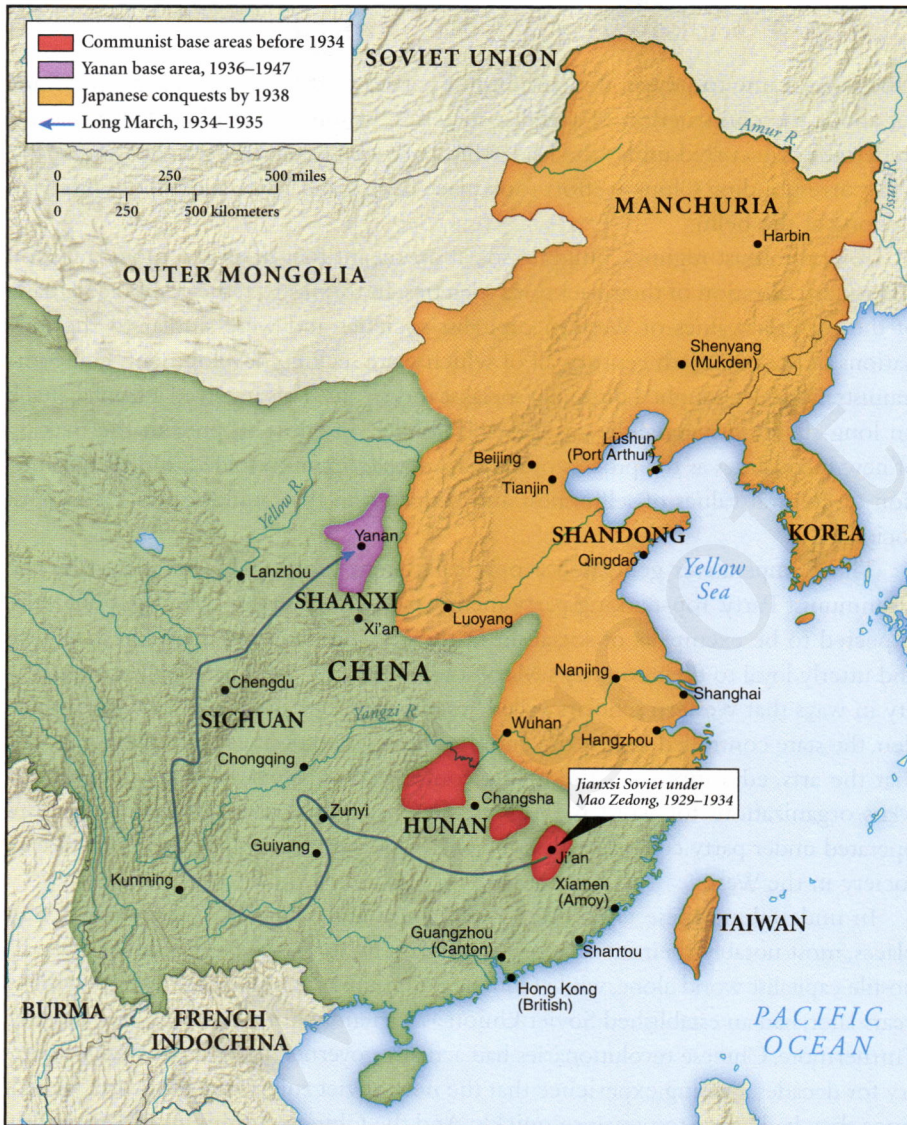
Map 22.2 The Rise of Communism in China Communism arose in China at the same time as the country was engaged in a terrible war with Japan and in the context of a civil war with Guomindang forces.

sharply with the massive corruption of Guomindang officials. It put down deep roots among the peasantry in a way that the Bolsheviks never did. And whereas the Bolsheviks gained support by urging Russian withdrawal from the highly unpopular First World War, the CCP won support by aggressively pursuing the struggle against Japanese invaders during World War II. In 1949, four years after the war's end, the Chinese communists swept to victory over the Guomindang, many of whose followers fled to Taiwan. Mao Zedong announced triumphantly in Beijing's Tiananmen Square that "the Chinese people have stood up."