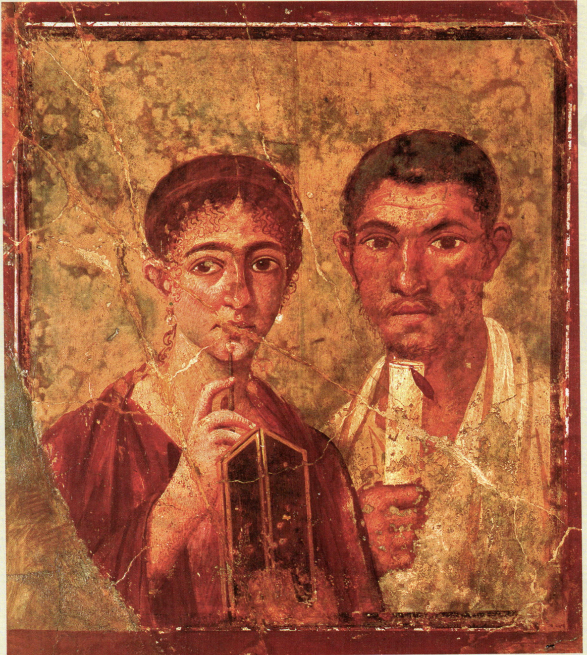
Visual Source 6.1 Terentius Neo and His Wife