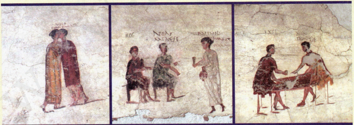
Visual Source 6.3 Scenes in a Pompeii Tavern

The lives of the less exalted appear infrequently in the art of Pompeii, but the images in Visual Source 6.3 provide some entrée into their world. These are frescoes painted on the wall of a caupona , an inn or tavern catering to the lower classes. This particular caupona was located at the intersection of two busy streets where it might easily attract customers. The first image shows Myrtale, a prostitute, kissing a man, while the caption above reads: “I don’t want to, with Myrtale.” In the second image a female barmaid serves two