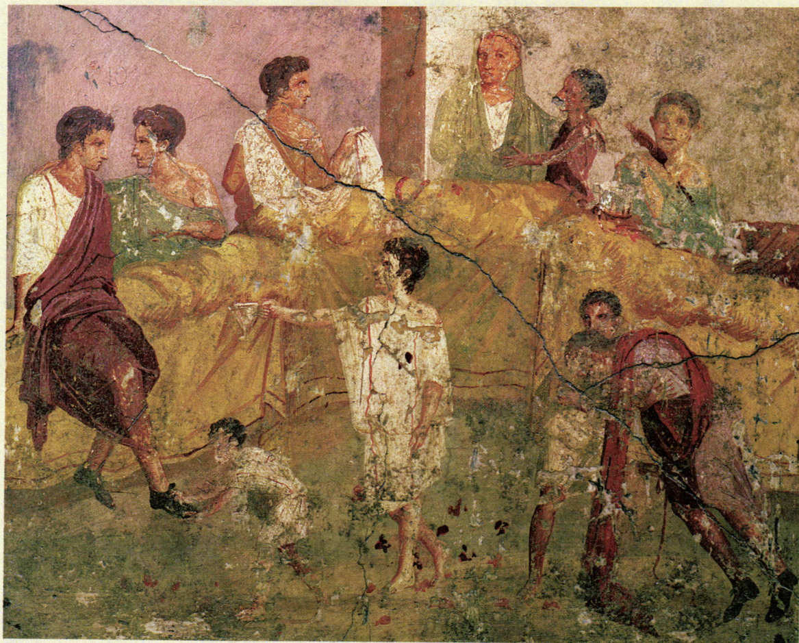
Visual Source 6.2 A Pompeii Banquet (Museo Archeologico Nazionale, Naples/Roger-Viollet/The Bridgeman Art Library)

friendly.” Graffiti too abounded, much of it clearly sexual. Here are three of the milder examples: “Atimetus got me pregnant”; “Sarra, you are not being very nice, leaving me all alone like this”; and “If anyone does not believe in Venus, they should gaze at my girlfriend.” 22