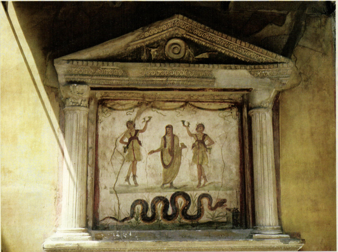
Visual Source 6.4 A Domestic Shrine

In addition to the official cults and the worship of household gods, by the first century C.E. a number of newer traditions, often called “mystery religions,” were spreading widely in the Roman Empire. Deriving from the eastern realm of the empire and beyond (Greece, Egypt, and Persia, for example), these mystery religions illustrate the kinds of cultural exchange that took place within the Empire. They offered an alternative to the official cults, for they were more personal, emotional, and intimate, usually featuring a ritual initiation into sacred mysteries, codes of moral behavior, and the promise of an afterlife. Among the most popular of these mystery cults in Pompeii was that of Isis, an Egyptian goddess who restored her husband/brother, Osiris, to life and was worshipped as a compassionate protector of the downtrodden.