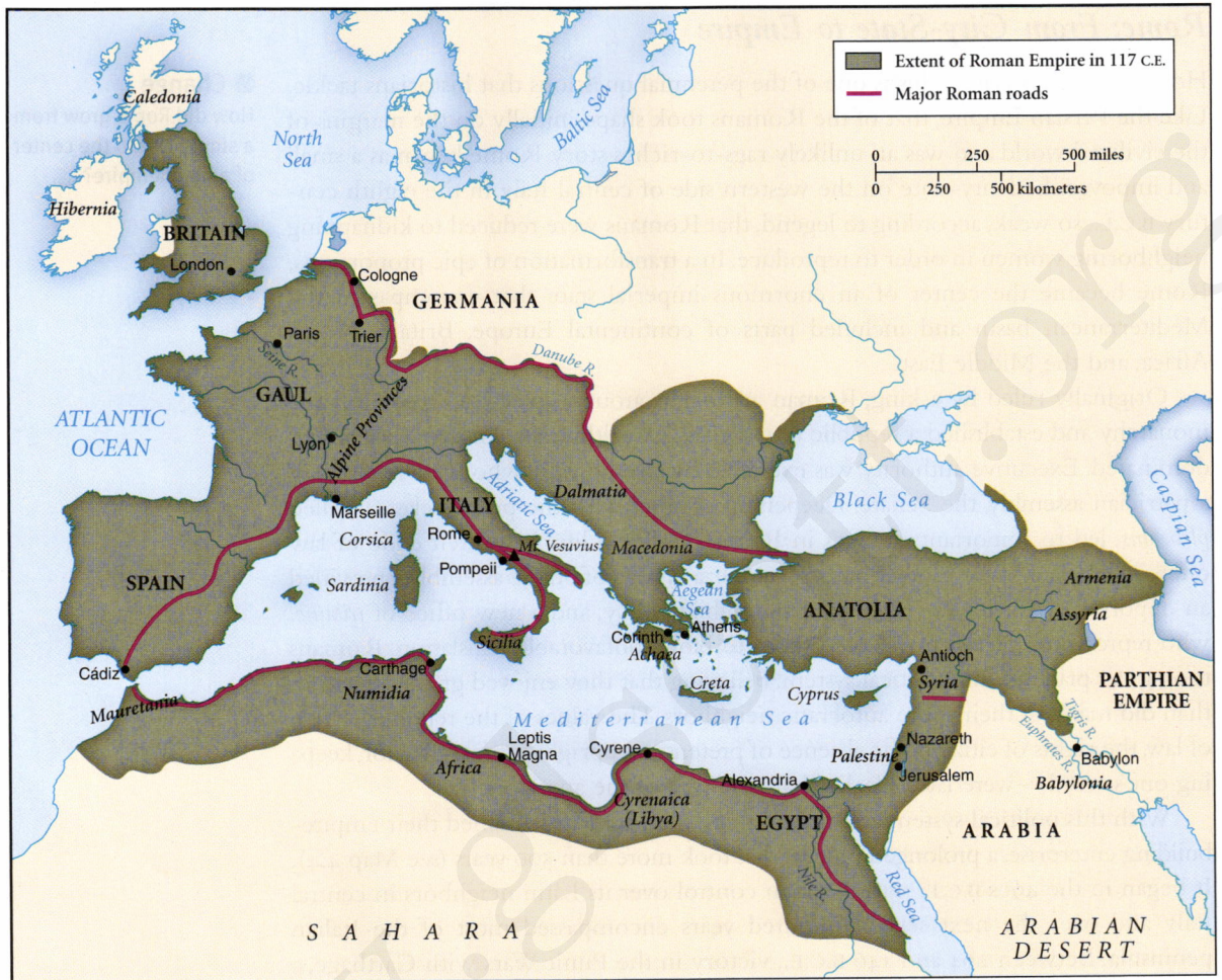
Map 4.4 The Roman Empire

At its height in the second century C.E., the Roman Empire incorporated the entire Mediterranean basin, including the lands of the Carthaginian Empire, the less developed region of Western Europe, the heartland of Greek civilization, and the ancient civilizations of Egypt and Mesopotamia.