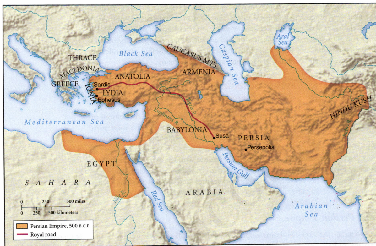
Map 4.1 The Persian Empire

At its height, the Persian Empire was the largest in the world. It dominated the lands of the First Civilizations in the Middle East and was commercially connected to neighboring regions.