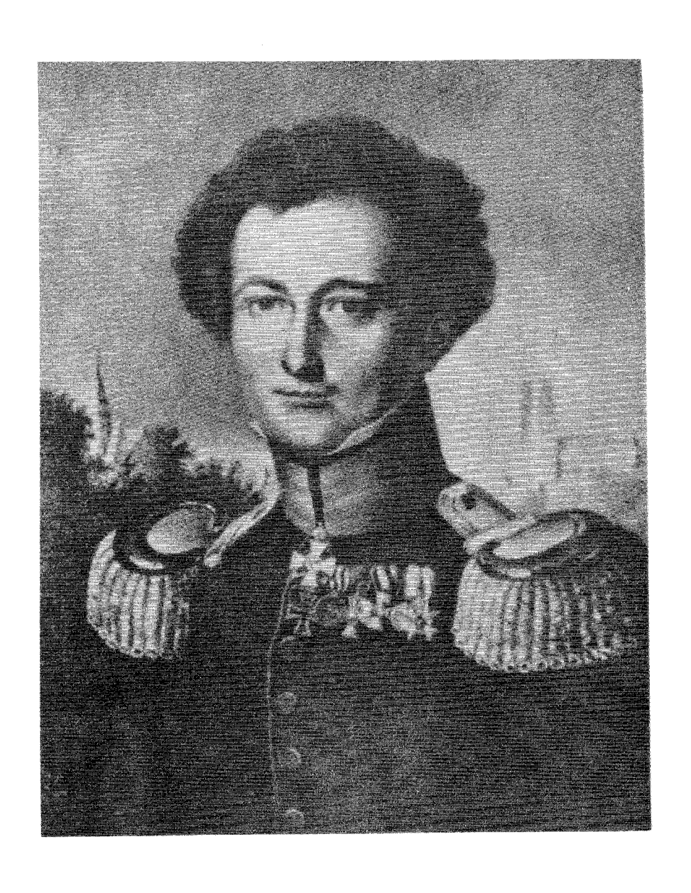
CARL VON CLAUSEWITZ