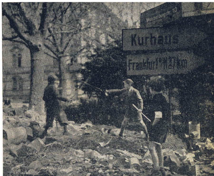
BOYS PLAY WITH NAZI SWORDS

... life for the German is bleak—for his conquerors, perplexing