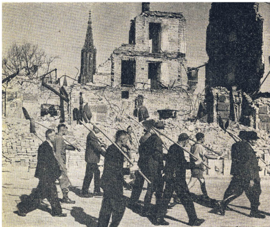
NAZIS WORK WITH SHOVELS

Reaction . The originally sullen timidity is disappearing. With the passage of time, Germans are growing somewhat bolder in their criticism of the Military Government. There is openly expressed resentment over such things as the rigidly enforced denazification policy. German