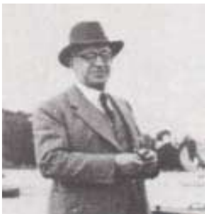
BROTHERTON LIBRARY, UNIVERSITY OF LEEDS