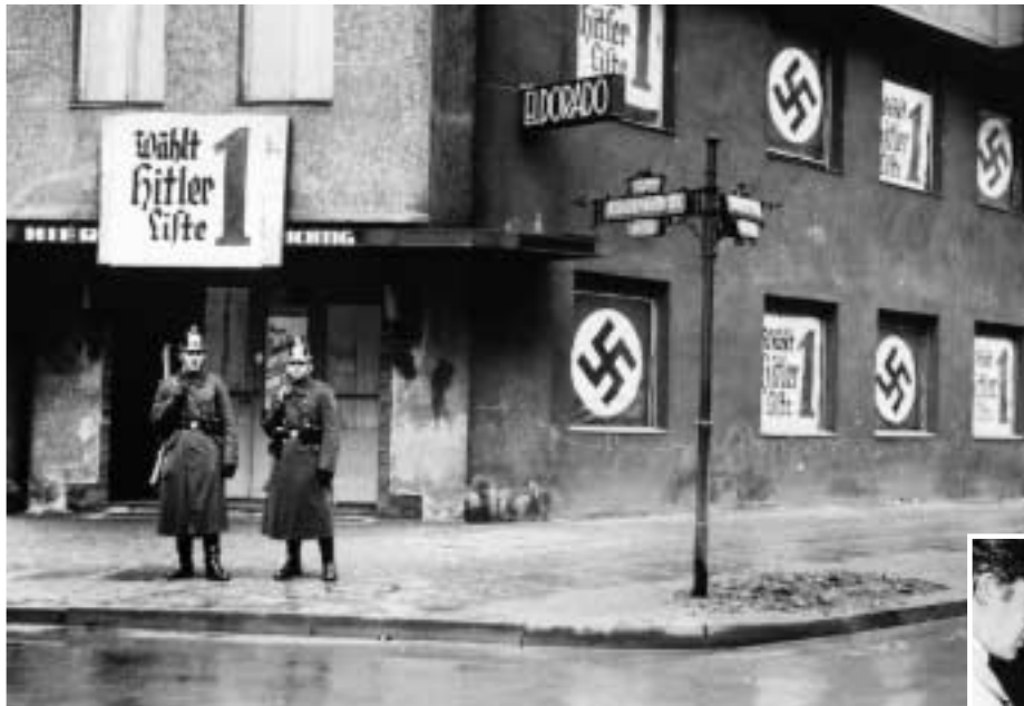
The closing of the Eldorado, a club where homosexuals socialized. Berlin, Germany, March 5, 1933.

Dr. Magnus Hirschfeld, a Jew and homosexual, founded the Institute for Sexual Sciences. Berlin, Germany, 1928.